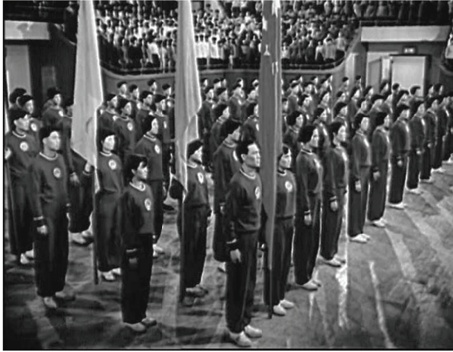
Still from Nǚlán wuhao [Girl Basketball Player No. 5]. Directed by Xie Jin. Shanghai Tian Ma, 1957, 01:21:26.