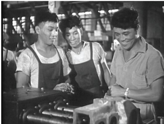
Figure 23: Hua Zhenlong Stops by a Local Factory to Help Out

Still from Shuishang chungiu [Two Generations of Swimmers], directed by Xie Tian, Beijing, 1959, 00:28:37.