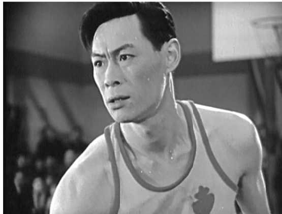
Figure 5: Tian Sweats as He Faces a Tough Decision in the "Old" Society

Still from Nǚlān wuhao [Girl Basketball Player No. 5]. Directed by Xie Jin. Shanghai Tian Ma, 1957, 00:26:26.