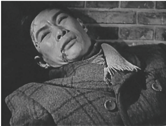
Figure 6: Tian's Bruised Body Lies in a Dark Alley in the "Old" Society

Still from Nǚlán wuhao [Girl Basketball Player No. 5]. Directed by Xie Jin. Shanghai Tian Ma, 1957, 00:29:23.