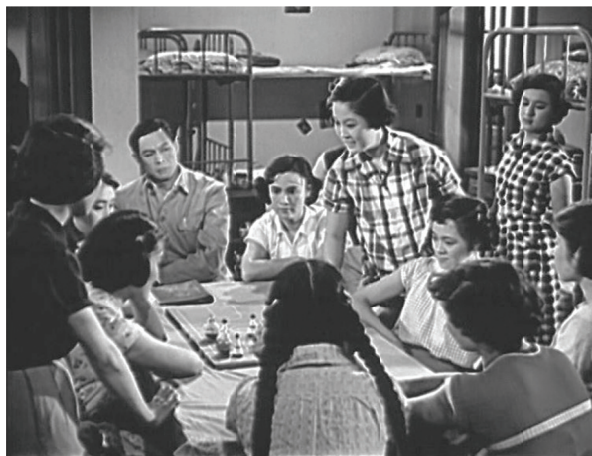
Figure 4: Discussing Team Strategy in the Players' Living Quarters, Lin Xiaojie Suggests Taking Advantage of Another Team's Weak Offense. Coach Tian Appears Displeased

Still from Nǚlǎn wúhào [Girl Basketball Player No. 5]. Directed by Xie Jin. Shanghai Tian Ma, 1957, 00:44:42.