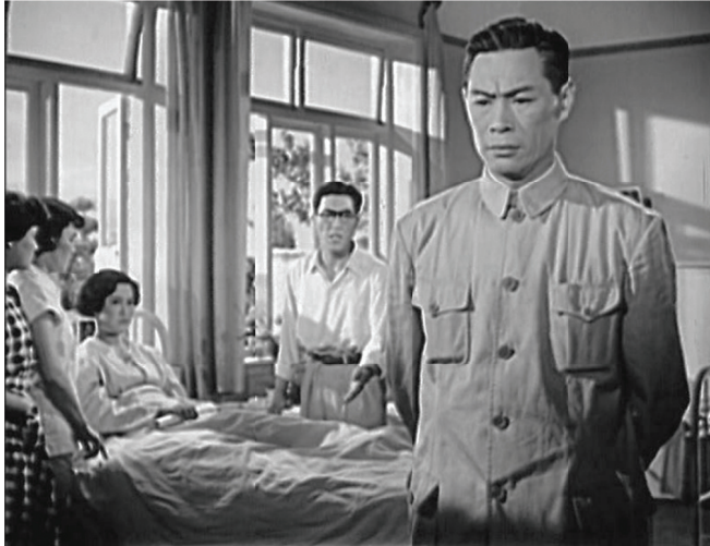
Still from Nǚlán wúhào [Girl Basketball Player No. 5]. Directed by Xie Jin. Shanghai Tian Ma, 1957, 01:08:36.

Such a statement describes humiliation viscerally – the veteran athlete is emotionally “hurt” through this past experience of not seeing his nation’s flag at an international competition. Moreover, with the phrase “up against a country of six hundred million people” it is clear that elite athletes embody communist China (“red flag with its five stars”) on the world stage. In the final scene of the film, Tian and much of the team stand in the national uniform – along with male team members – as the anthem plays [Figure 9]. They then happily board a modern airplane – another sign of national progress – to head off for international competition.