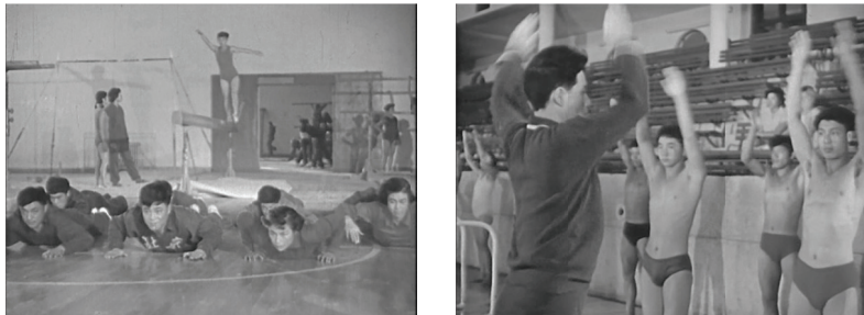
Figure 15 & 16: Dry Land Training and Pool Side Calisthenics

Stills from Shuishang chungiu [Two Generations of Swimmers], directed by Xie Tian, Beijing, 1959, 00:26:14 and 00:49:58.